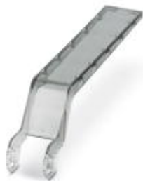
DIN rail housing, 8U, Marking lid, width: 18.8 mm

Please be informed that the data shown in this PDF Document is generated from our Online Catalog. Please find the complete data in the user's documentation. Our General Terms of Use for Downloads are valid ( http://phoenixcontact.com/download )