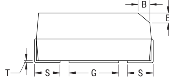
ANODE (+) END VIEW