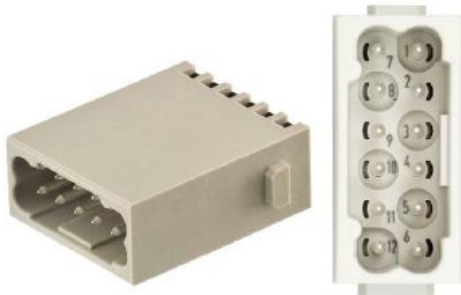
Illustration of the module and mating side before change