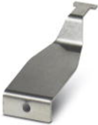
Strain relief, degree of protection: IP65/IP67, material: Stainless steel

Please be informed that the data shown in this PDF Document is generated from our Online Catalog. Please find the complete data in the user's documentation. Our General Terms of Use for Downloads are valid ( http://phoenixcontact.com/download )