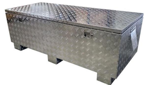
RPAL Diamond Plate Aluminum Ground Mount