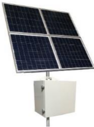
RPSTL 340W 4 Panel Solar System