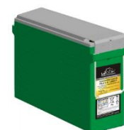
AGM 12V 180Ah Battery