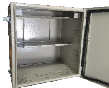
RPSTL Enclosure interior without batteries or controller