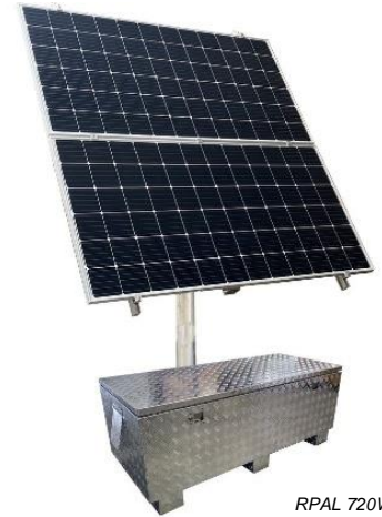
RPAL 720W Solar System