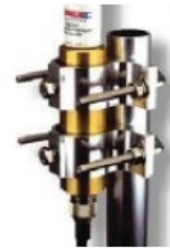
FM2 Mounting Kit (Sold separately)