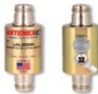
Lightning Arrestor LABH350NN (Sold Separately)