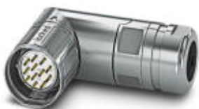
The figure shows the 12-pos. product version with solder contacts

Cable connector, angled, shielded: yes, SPEEDCON locking, M23, No. of pos.: 16, type of contact: Pin, Crimp connection, cable diameter range: 4 mm ... 6 mm