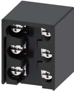
Contact block for position switch 3SE51/52 2 NO/1 NC slow-action contact