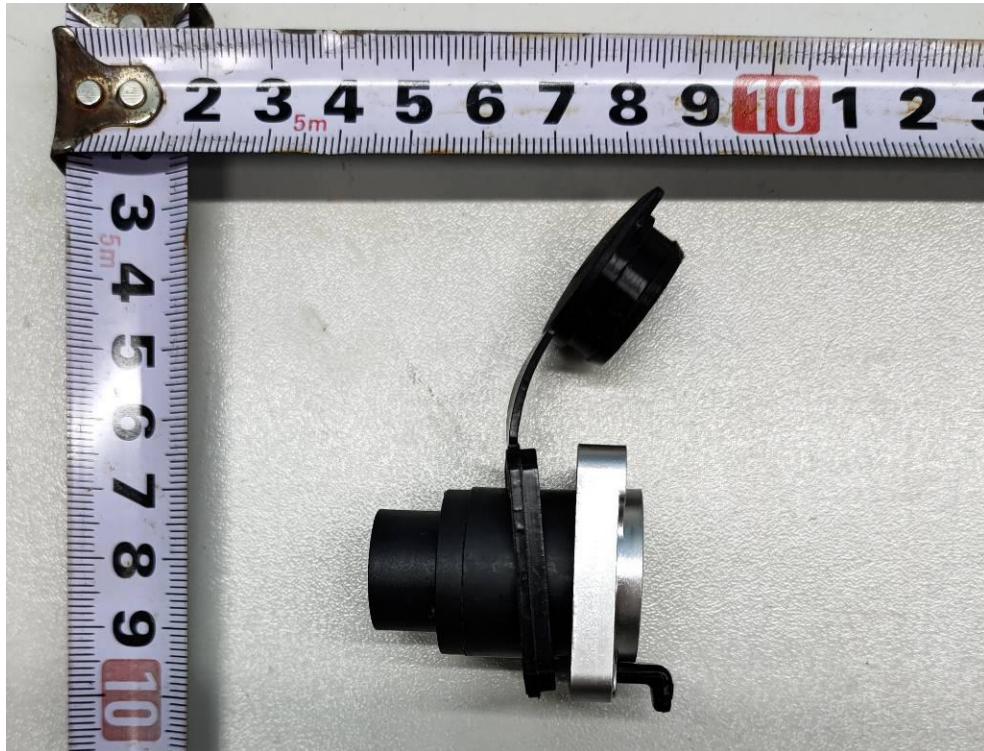
Network cable socket