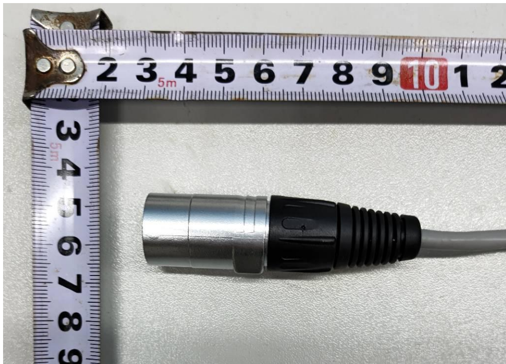
Network cable plug