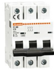
Miniature circuit breaker (MCB) P1 MB 3P 3 IEC / UL1077