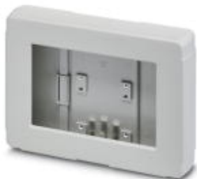
Display housing, 7", light gray, central window, front level, for battery pack consisting of two half shells, with screws and battery pack contacts

Please be informed that the data shown in this PDF Document is generated from our Online Catalog. Please find the complete data in the user's documentation. Our General Terms of Use for Downloads are valid ( http://phoenixcontact.com/download )