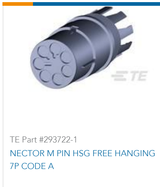
TE Part #293722-1 NECTOR M PIN HSG FREE HANGING 7P CODE A