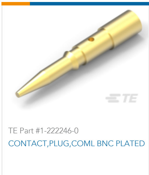
TE Part #1-222246-0 CONTACT, PLUG, COM1 BNC PLATED