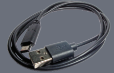
USB Cable Type A to C