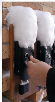
Clocking in after a blizzard.