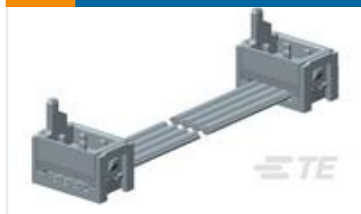
TE Part #1483350-1 MICRO-MATCH LEAD 04P 100MM