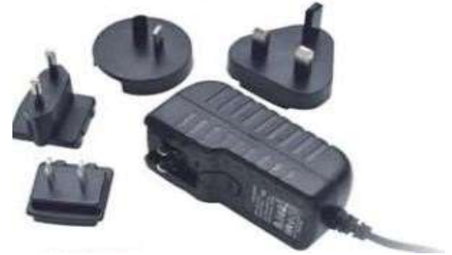
*Product images are for illustrative purposes only and may vary from actual design.