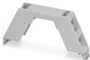
DIN rail housing, Upper housing part for PCB terminal blocks with screw connection, width: 17.6 mm, color: light gray (7035)

Please be informed that the data shown in this PDF Document is generated from our Online Catalog. Please find the complete data in the user's documentation. Our General Terms of Use for Downloads are valid ( http://phoenixcontact.com/download )