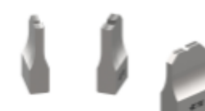
ANVIL REPRESENTATION ONLY