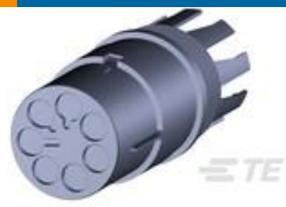
TE Part #293722-1 NECTOR M PIN HSG FREE HANGING 7P CODE A